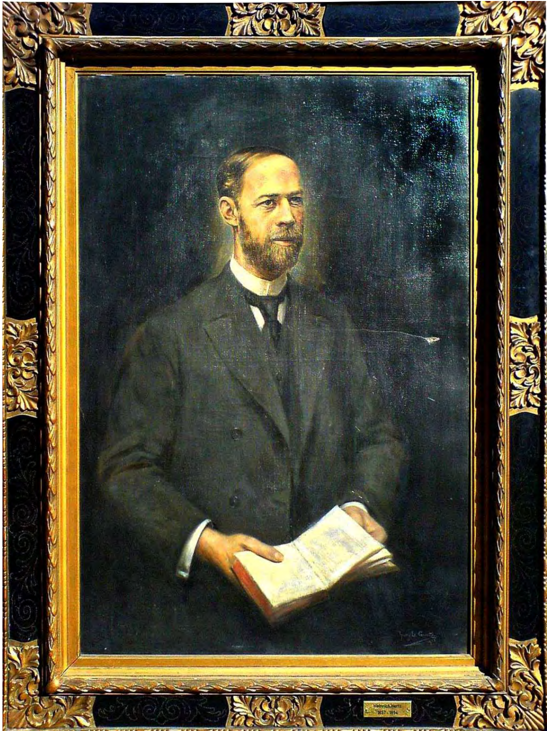
Figure 0.1: Portrait of Heinrich Hertz (1857–1894) Painting in the Department of Physics, Hamburg University