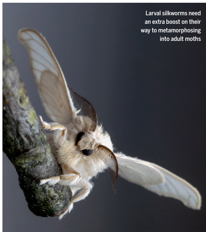
Larval silkworms need an extra boost on their way to metamorphosing into adult moths